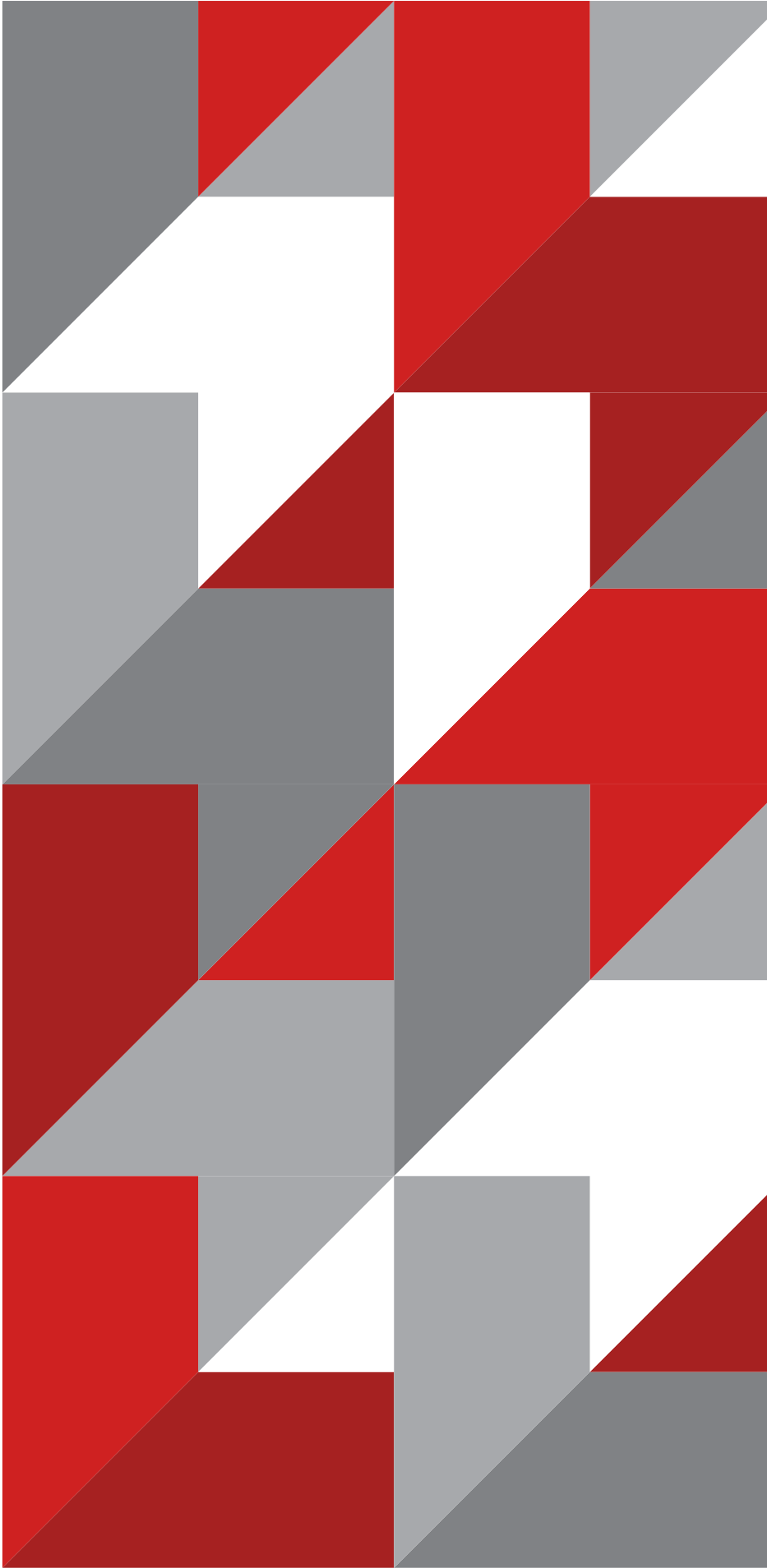
Narratives travelling the information space