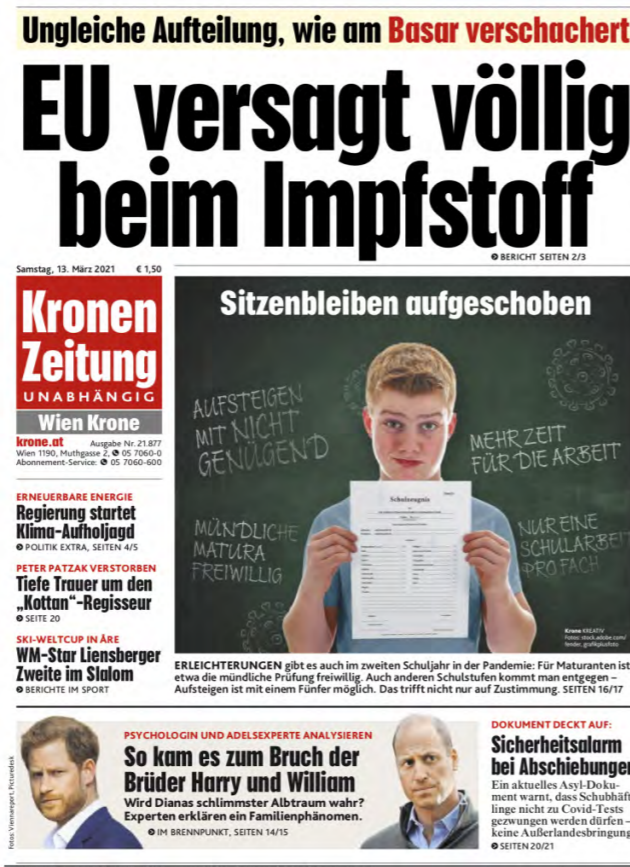
Kronen Zeitung, 13.03.2021 EU versagt völlig beim Impfstoff (EU fails completely with vaccines)