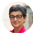
Arancha González Laya

President of the Wilfried Martens Centre for European Studies