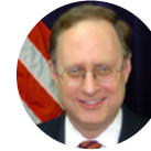
Alexander Vershbow Distinguished Fellow, Transatlantic Security Initiative, The Atlantic Council