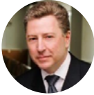
Kurt Volker Former U.S. Special Representative for Ukraine