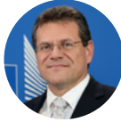
Maroš Šefčovič Vice-President of the European Commission, Interinstitutional Relations and Foresight