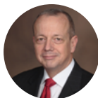
John R. Allen

Former Europe advisor to French President; Présidence de la République