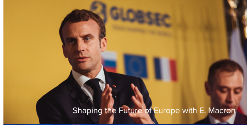
Shaping the Future of Europe with E. Macron