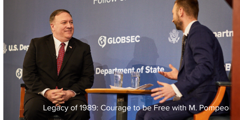
Legacy of 1989: Courage to be Free with M. Pompeo