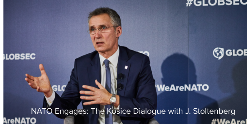
NATO Engages: The Kösice Dialogue with J. Stoltenberg